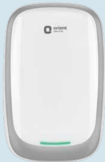
IWAU03VPS8M3-WG | IWAU03VPS8M4-WG IWAU01VPS8M3-WG | IWAU01VPS8M4-WG