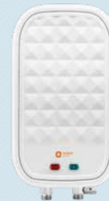
IWRV03VPS6M3-WW (3L, 3kW)