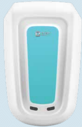
IWRP55VPS6M3-WB (5.5L, 3 kW)