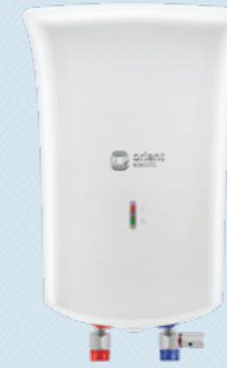
IWPM03VPS8M3-WW (3L, 3kW)