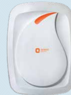
IWFT03VPS6M3-WW (3L, 3kW)