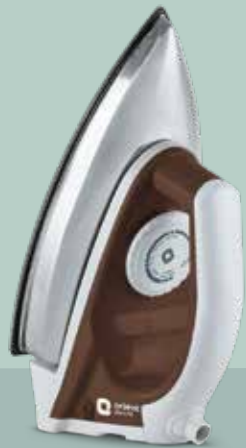
750W Metal Body

APPROVED BY: 2-year Replacement warranty