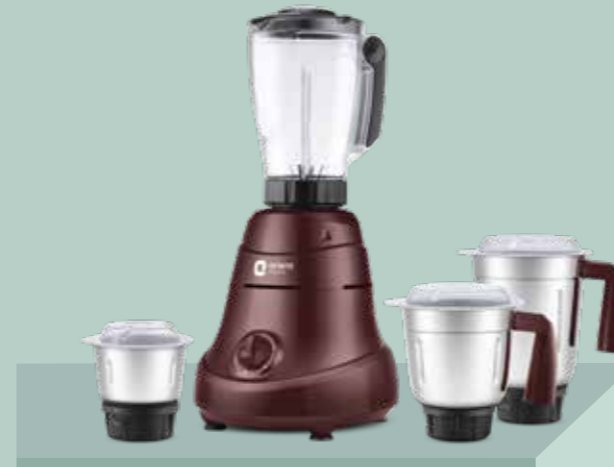
Chutney jar (0.4L) | Dry/Wet jar (1L) Liquidising jar (1.5L) | Juicer jar with fruit filter (1.5L)

APPROVED BY: 5-year Motor warranty 2-year Product warranty