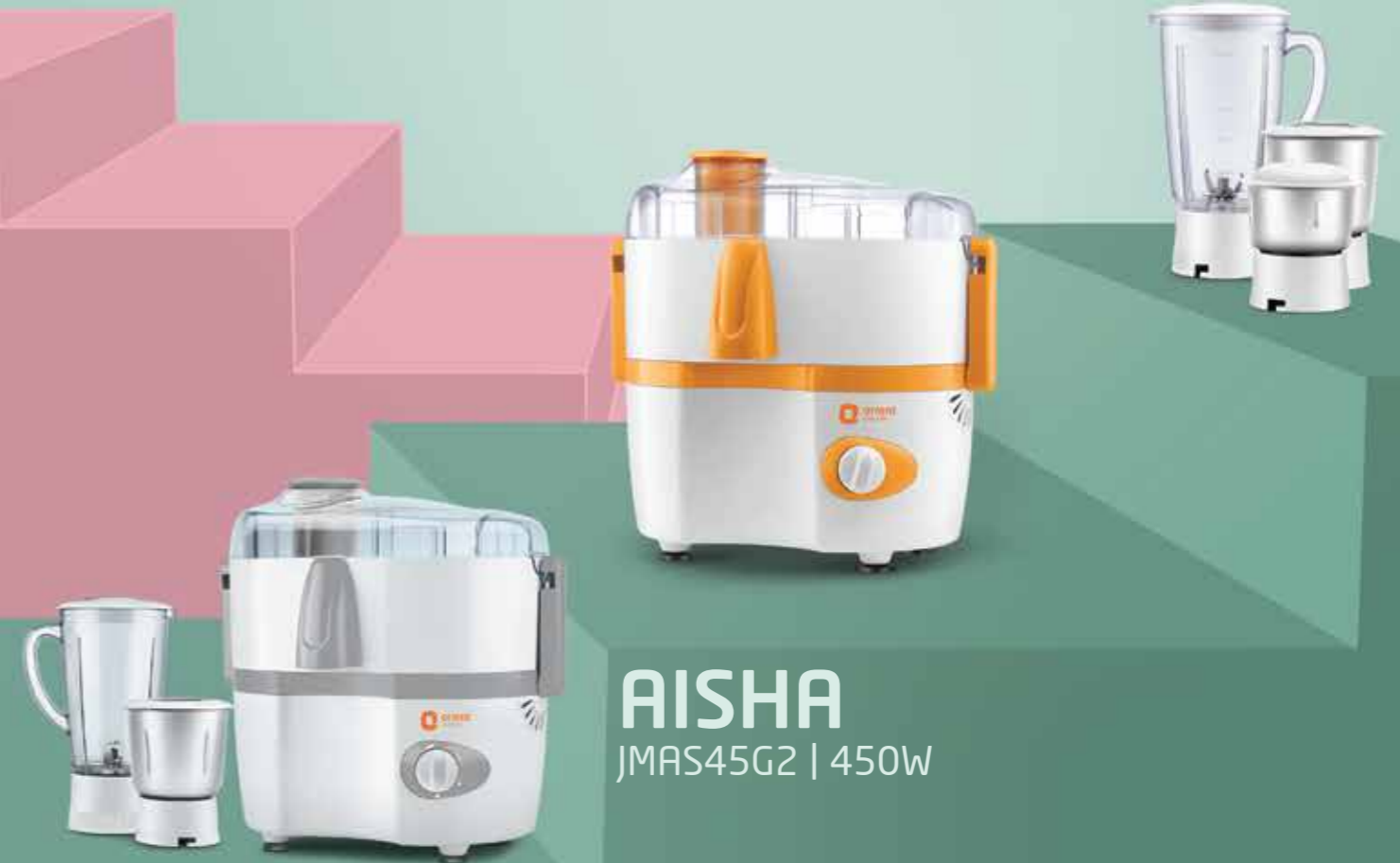
AISHA JMAS45G2 | 450W

Dry/Wet jar (0.8L) Liquidising jar (1.5L)