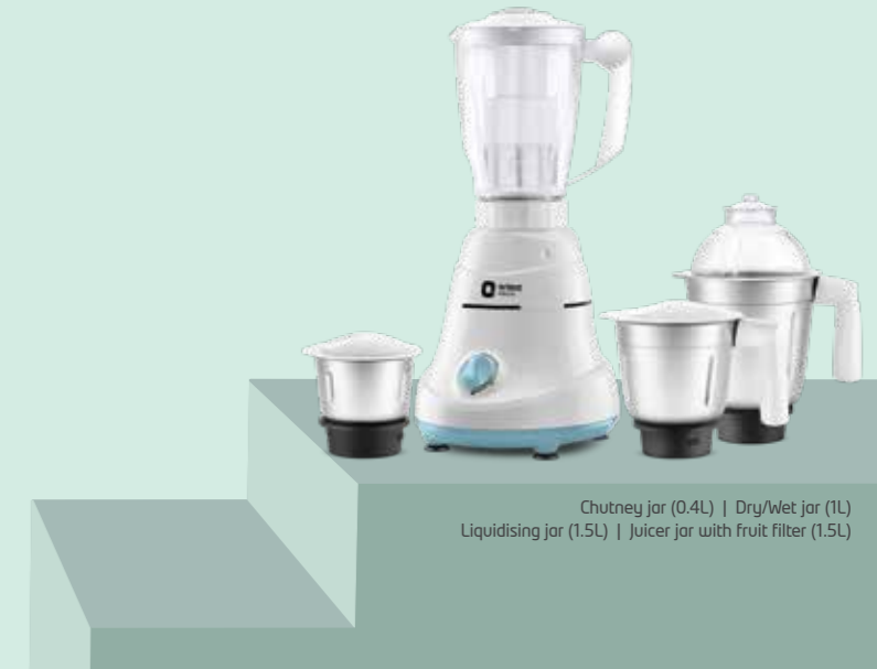
Chutney jar (0.4L) | Dry/Wet jar (1L) Liquidising jar (1.5L) | Juicer jar with fruit filter (1.5L)

APPROVED BY: 5-year Motor warranty 2-year Product warranty