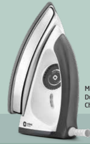
Metal Body Dual LED Indicator Chrome finish