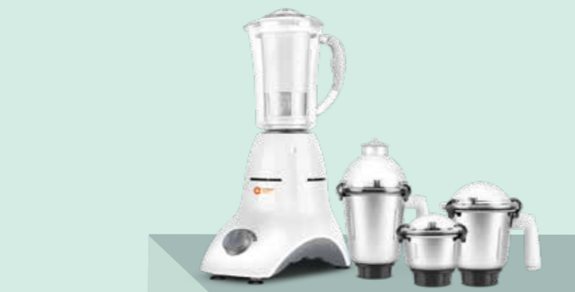
Chutney jar (0.5L) | Dry/Wet jar (1L) Liquidising jar (1.5L) | Juicer jar with fruit filter (1.5L)

Images shown are for representation purpose only. Actual products may vary.