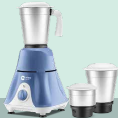
Chutney jar (0.3L) | Dry/Wet jar (0.8L) Liquidising jar (1L)

Images shown are for representation purpose only. Actual products may vary.