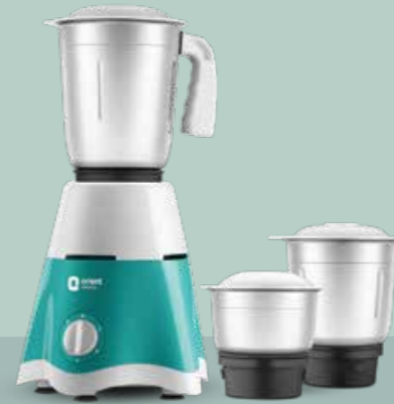
Chutney jar (0.3L) | Dry/Wet jar (0.7L) Liquidising Jar (1.2L)