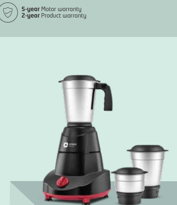
Chutney jar (0.4L) | Dry/Wet jar (0.8L) Liquidising jar (1.2L)

APPROVED BY: 5-year Motor warranty 2-year Product warranty