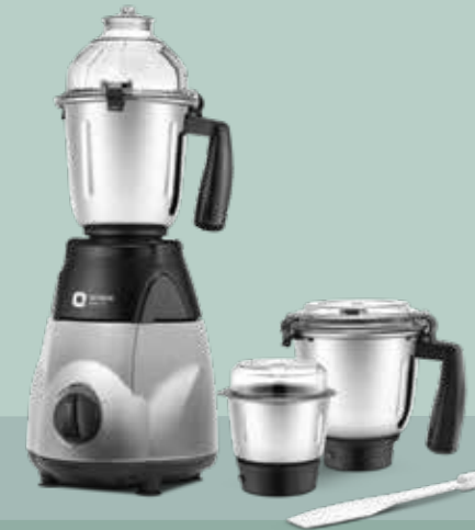
Chutney jar (0.4L) | Dry/Wet jar (1L) Liquidising Jar (1.5L)