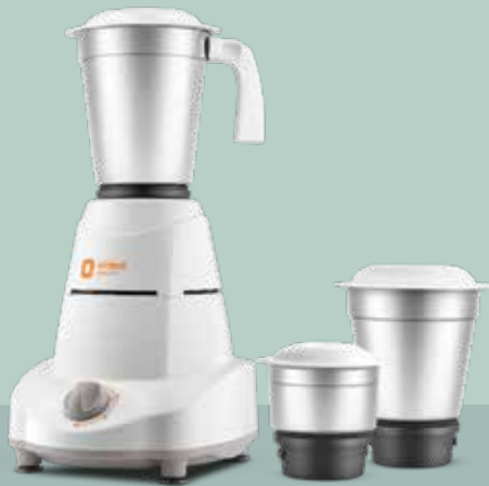
Chutney jar (0.3L) | Dry/Wet jar (0.8L) Liquidising jar (1L)

APPROVED BY: 5-year Motor warranty 2-year Product warranty