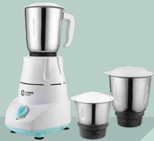
Chutney jar (0.3L) | Dry/Wet jar (0.8L) Liquidising jar (1.1L)

APPROVED BY: 5-year Motor warranty 2-year Product warranty