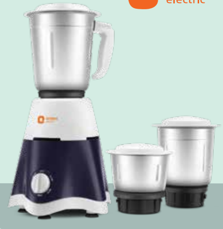
Chutney jar (0.3L) | Dry/Wet jar (0.7L) Liquidising Jar (1.2L)

APPROVED BY: 5-year Motor warranty 2-year Product warranty