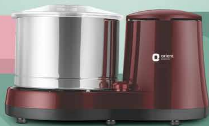
GRIND MASTER WGGM152M | 150W

Easy To Clean Detachable Stainless-steel drum