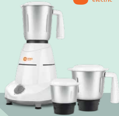
Chutney jar (0.4L) | Dry/Wet jar (0.8L) Liquidising jar (1.2L)

APPROVED BY: 5-year Motor warranty 2-year Product warranty