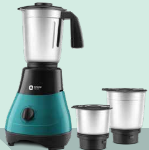
Chutney jar (0.3L) | Dry/Wet jar (0.7L) Liquidising jar (1.2L)

APPROVED BY: 2-year Motor warranty 2-year Product warranty