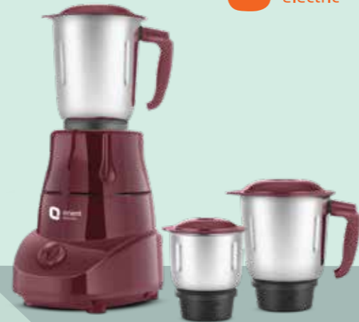
Chutney jar (0.5L) | Dry/Wet jar (0.8L) Liquidising Jar (1.2L)

APPROVED BY: 2-year Motor warranty 2-year Product warranty