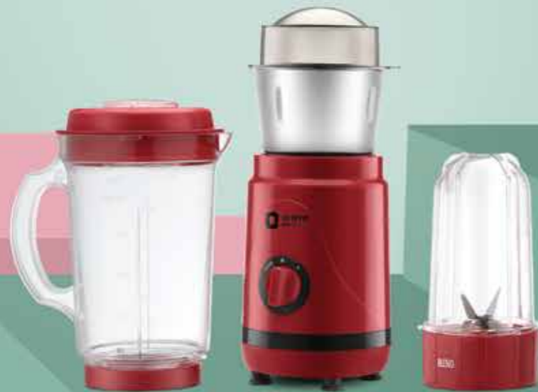
GEENIE MGGN40RB3 | 400W

APPROVED BY: 2-year Motor warranty 2-year Product warranty