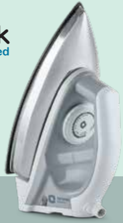
1000W Metal Body

APPROVED BY: 2-year Replacement warranty