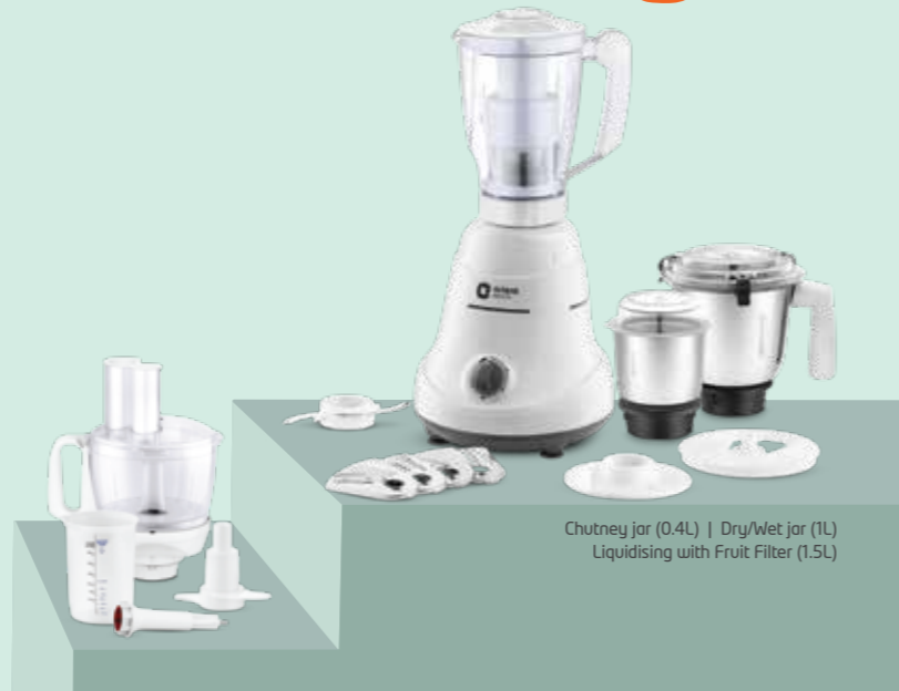
Chutney jar (0.4L) | Dry/Wet jar (1L) Liquidising with Fruit Filter (1.5L)

APPROVED BY: 5-year Motor warranty 2-year Product warranty