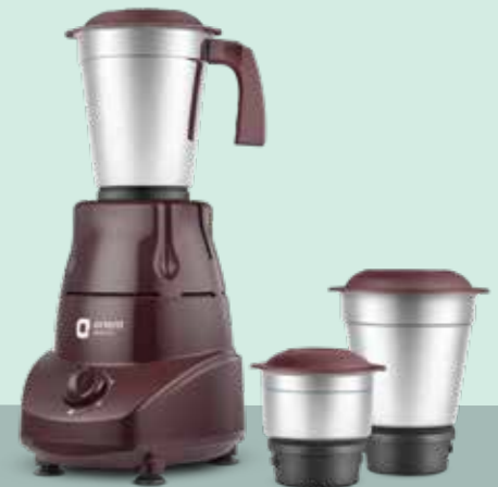
Chutney jar (0.3L) | Dry/Wet jar (0.8L) Liquidising jar (1L)

Images shown are for representation purpose only. Actual products may vary.