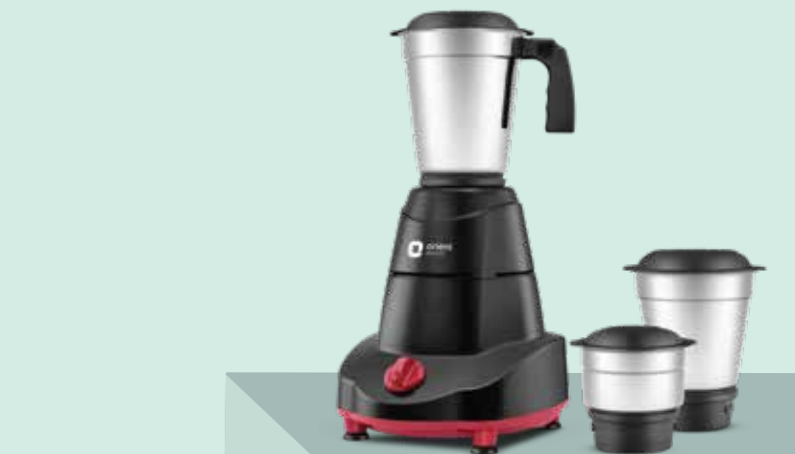
Chutney jar (0.4L) | Dry/Wet jar (0.8L) Liquidising jar (1.2L)

Images shown are for representation purpose only. Actual products may vary.